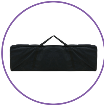
QTY 1: Black Nylon Carry Bag