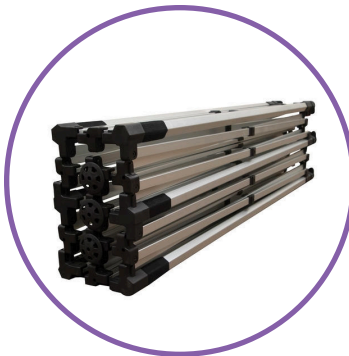
QTY 1: Frame w/ Pre-Installed Graphic