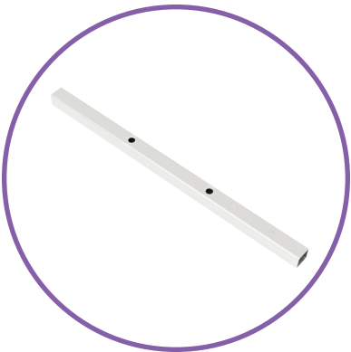
QTY 1: Rail Center Connector