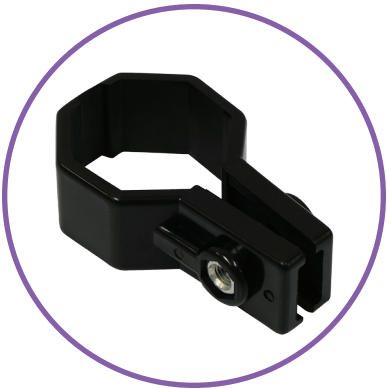
QTY 2: Rail Clamp Bar