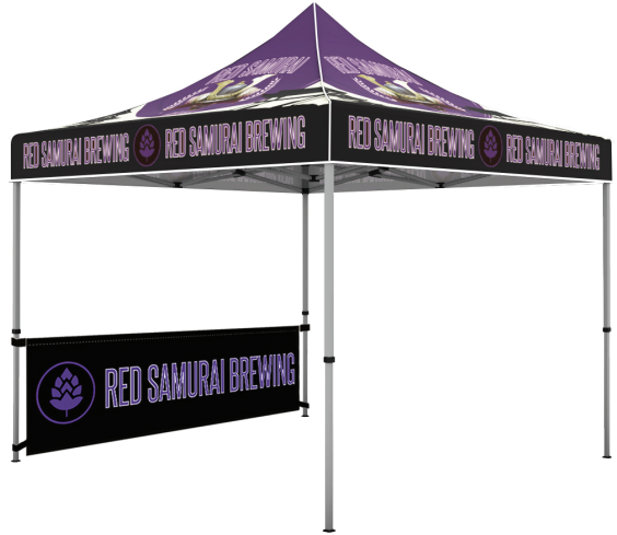
Half Side Wall Double-Sided