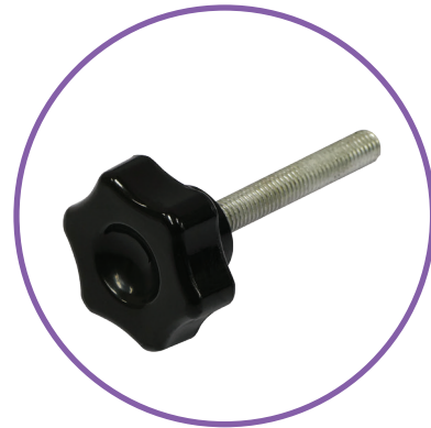
QTY 2: Rail Clamp Screw