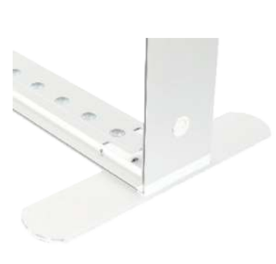
TOOL FREE ASSEMBLY