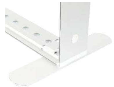
TOOL FREE ASSEMBLY